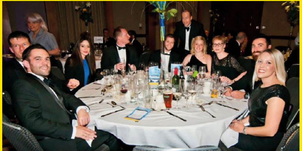
SEARCH LABORATORY AT THE 2014 STRICTLY SPARKLE DINNER DANCE

To find out more, or to book your place today, please visit www.btrs.org.uk/ball