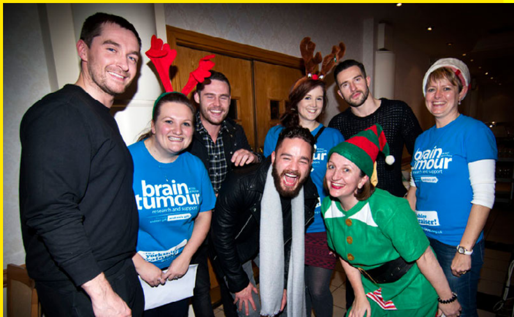
THE BTRS TEAM WITH EMMERDALE CAST MEMBERS, FROM LEFT, ANTHONY QUINLAN, DANNY MILLER, ADAM THOMAS AND MICHAEL PARR

Over the coming months the Leeds Support Group will welcome further guest speakers