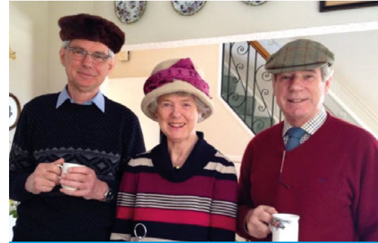
BRAIN TUMOUR AWARENESS MONTH – OUR FABULOUS FUNDRAISERS SHOWING THEIR SUPPORT

Want to take it one step further? Why not throw on some tweed, pour a cup of Yorkshire tea